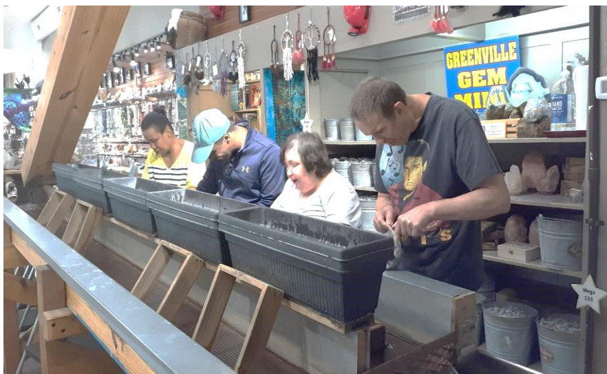
GEM MINING AT GREENVILLE GEM MINE

Thrive Upstate is fully committed to providing services in this way.